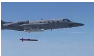
Target reel out at 220 KIAS