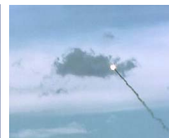
Realtime scoring solutions