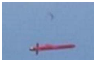
Target released and executes pre-programmed, multiple way point GPS navigation during free flight