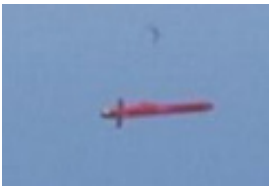
Target released and executes pre-programmed, multiple way point GPS navigation during free flight