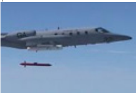
Target reel out at 220 KIAS